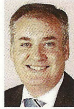
Richard Lochhead SNP MSP for Moray

The Scottish Parliament Pàrlamaid na h-Alba